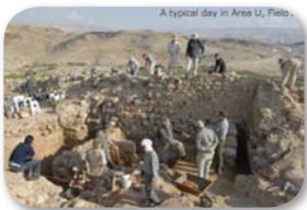
A typical day in Area U, Phase

Have a penchant for antiquity? The Tall el-Hammam Excavation Project is in